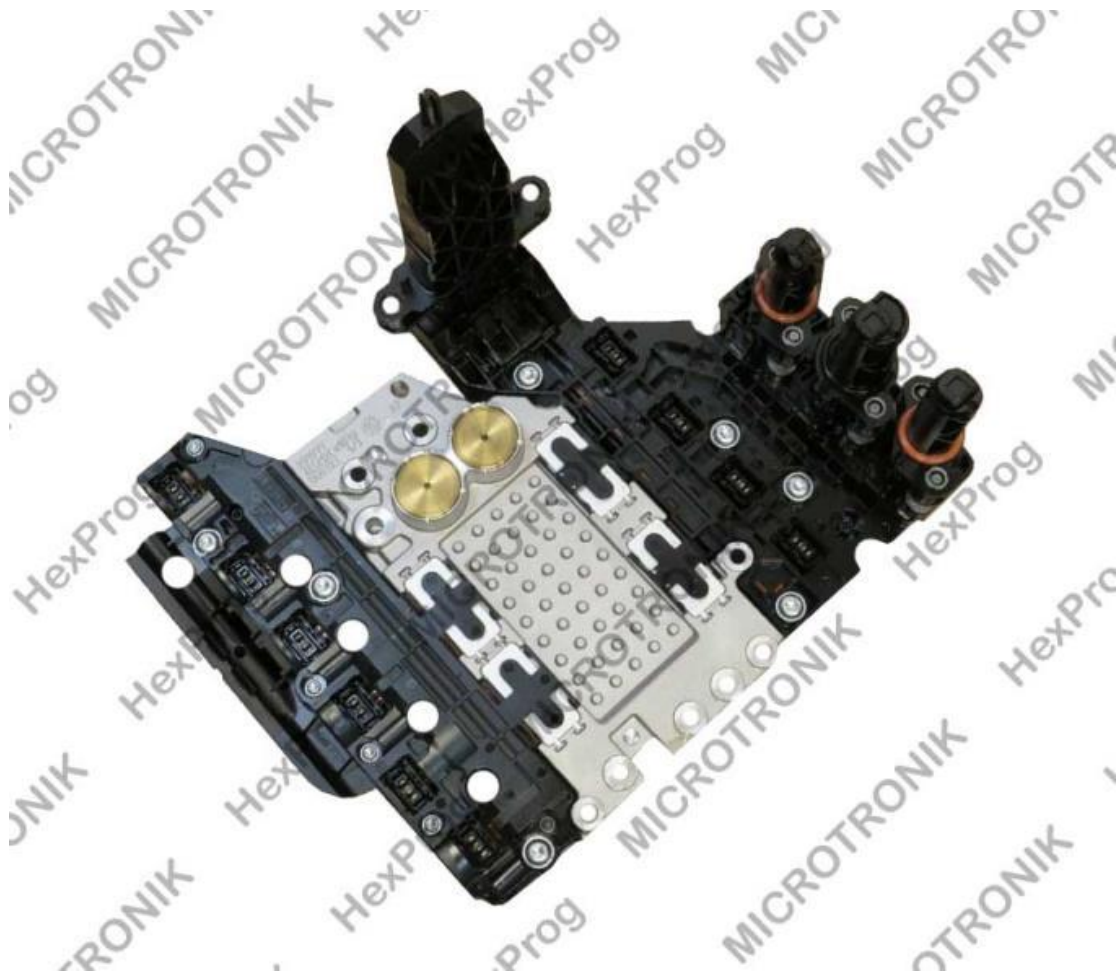
Alpina-DKG 436 Gen1-Module

You cannot use OBD Flash files to write into the ECU